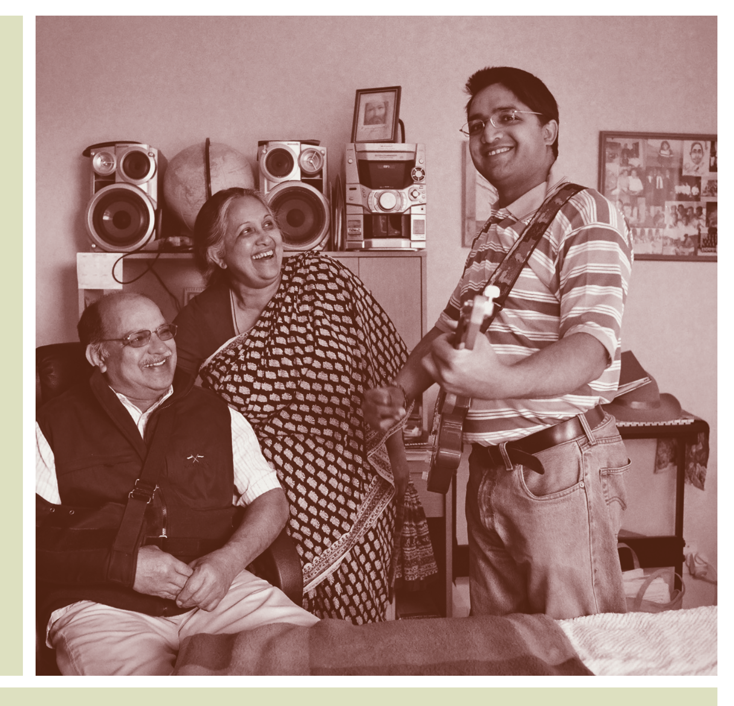
The New Zealand Carers' Strategy