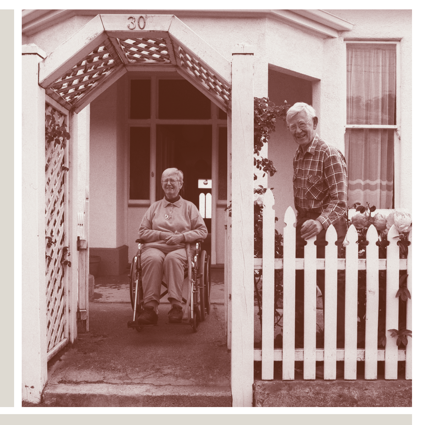
Action Plan for 2014 to 2018