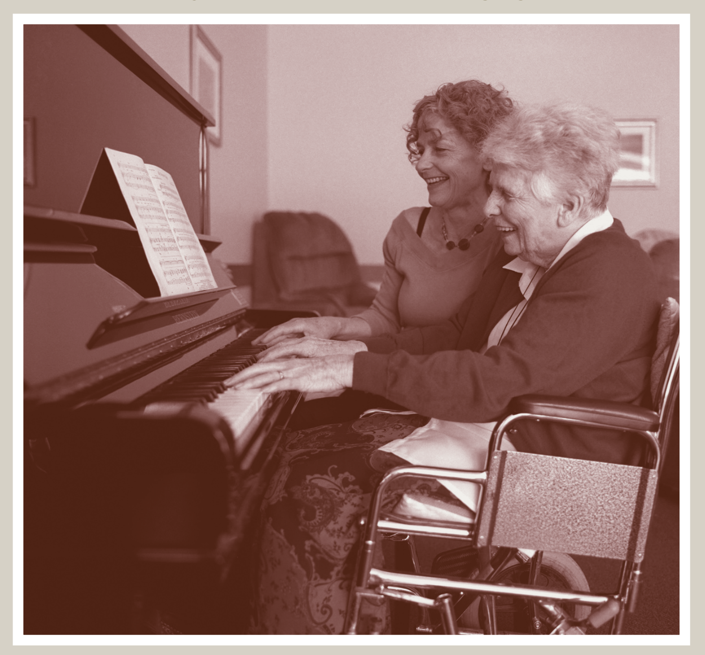
The New Zealand Carers' Strategy Action Plan for 2014 to 2018